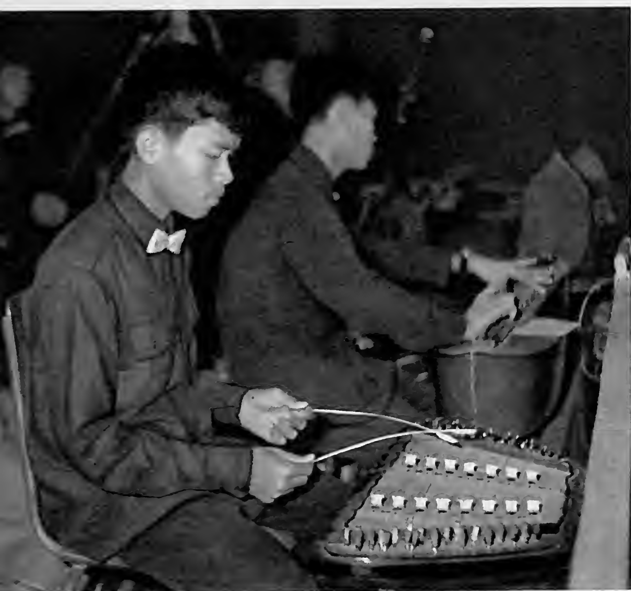
Performing revolutionary songs.